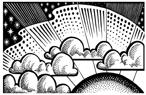
The law of the LORD is perfect, refreshing the soul; the decree of the LORD is trustworthy, giving wisdom to the simple. -- Psalm 19:8